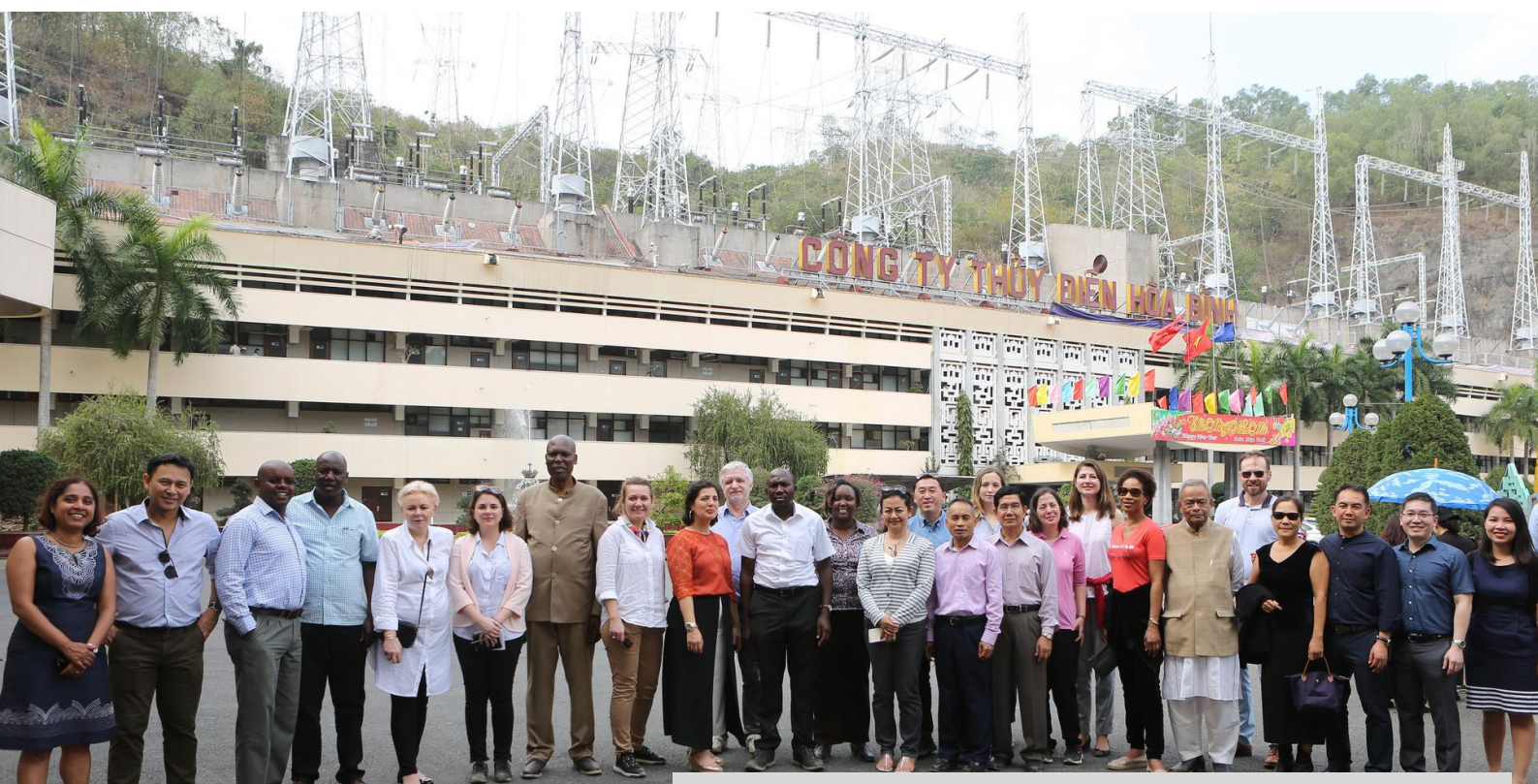
Parliamentary Network delegation at the Hoa Binh hydropower plant

their approach to integrating farmers into supply chains, creating jobs and upgrading urban and rural infrastructure for socio-economic development. They visited several World Bank projects, including the Northern Mountains Urban Programs Project and the Vietnam Road Asset Management Project.