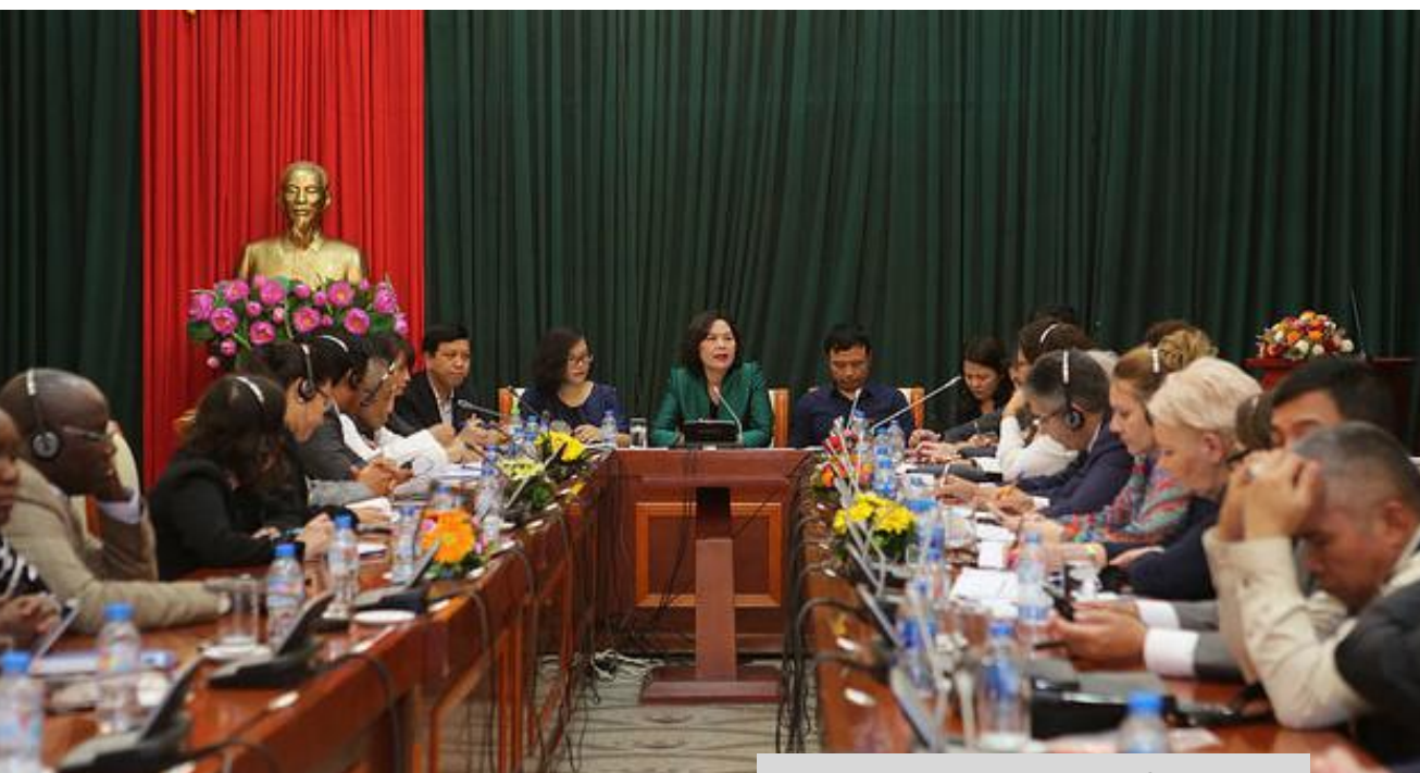
Meeting at the State Bank of Vietnam