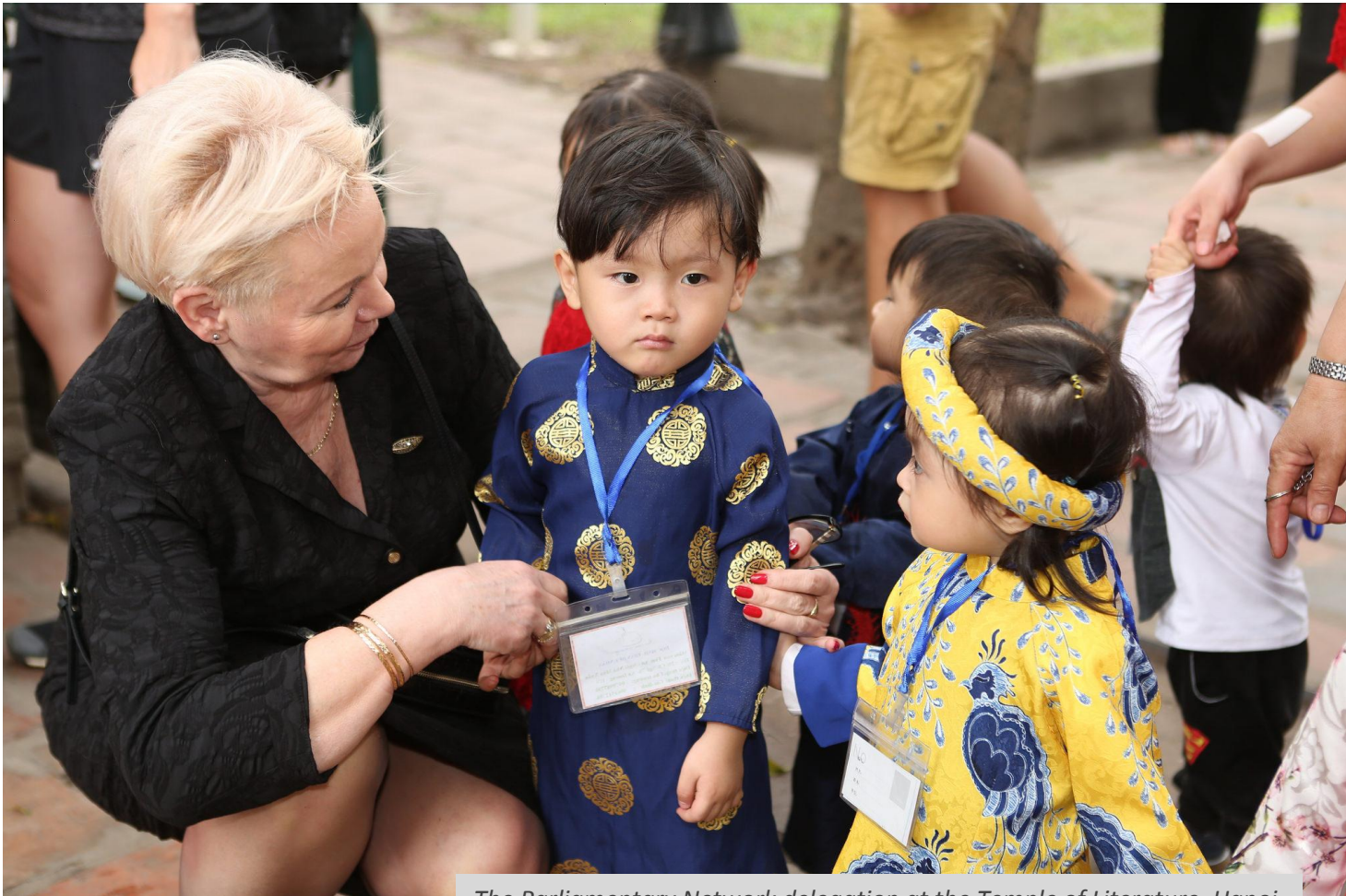
The Parliamentary Network delegation at the Temple of Literature, Hanoi