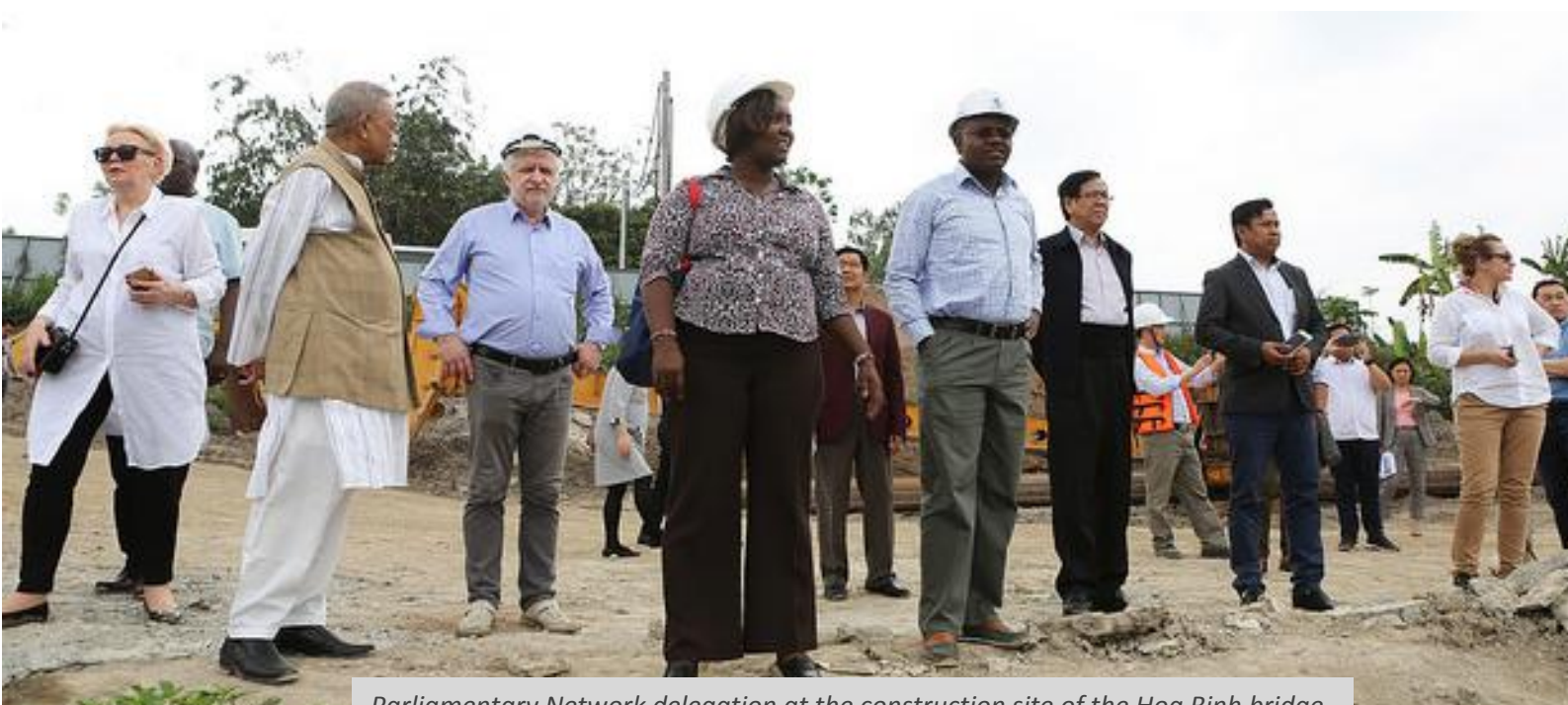
Parliamentary Network delegation at the construction site of the Hoa Binh bridge

The delegates raised questions about procurement oversight and use of local labor in the World Bank projects. They expressed concerns about the durability of jobs created at these projects. The Vice-Chairman explained that the percentage of population vulnerable to falling back into poverty in the province has declined significantly. Women and youth have a particularly high level of participation in projects that give them voice in determining community priorities.