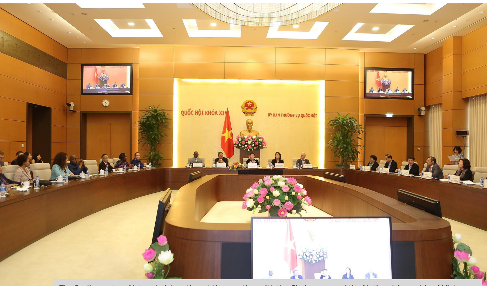
The Parliamentary Network delegation at the meeting with the Chairwoman of the National Assembly of Vietnam

Vietnam has now completed its legal framework on market economy, and can fully engage in international integration, concluding several free-trade agreements. The delegates congratulated the National Assembly on the conclusion of the Comprehensive and Progressive Agreement for Trans-Pacific Partnership, the third largest trade agreement in the world, due to be signed a day after the meeting.