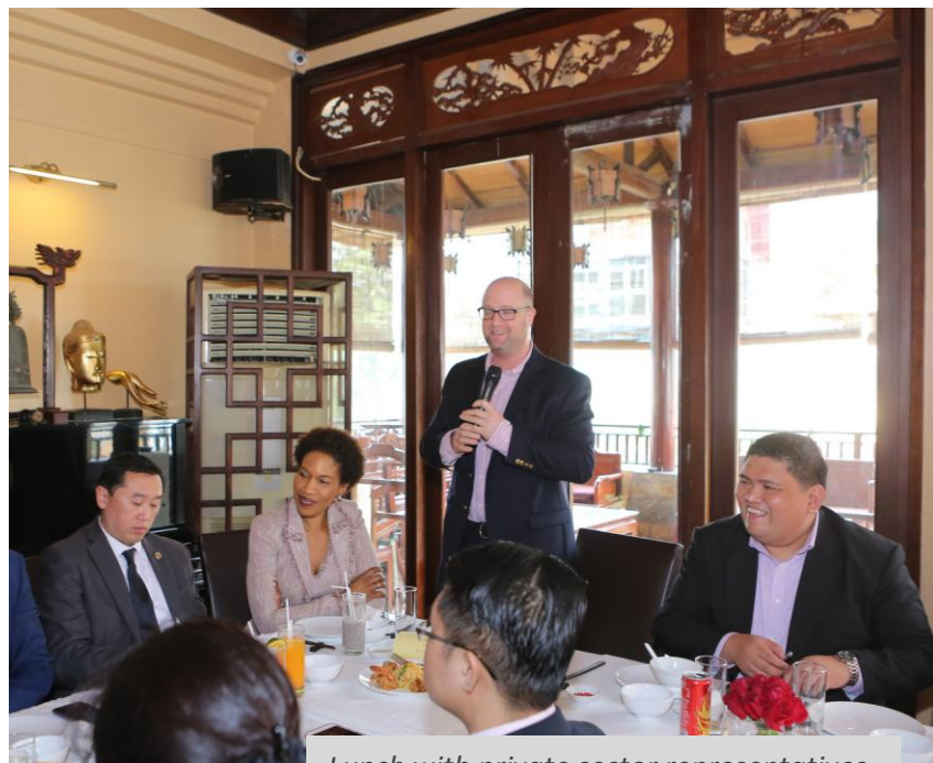
Lunch with private sector representatives