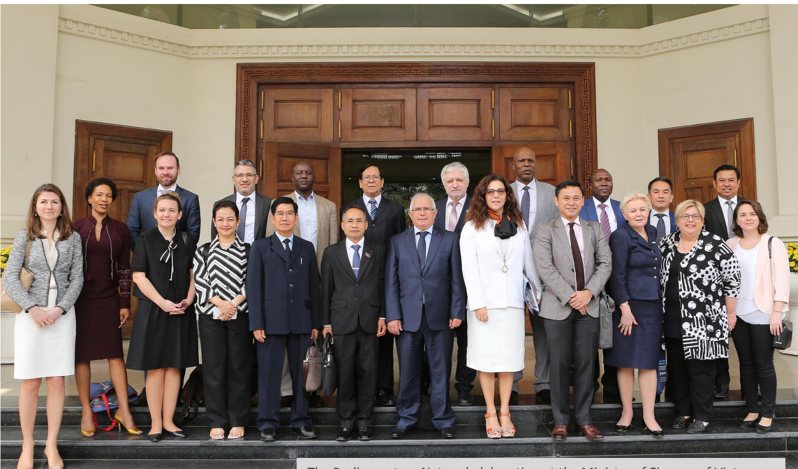
The Parliamentary Network delegation at the Ministry of Finance of Vietnam