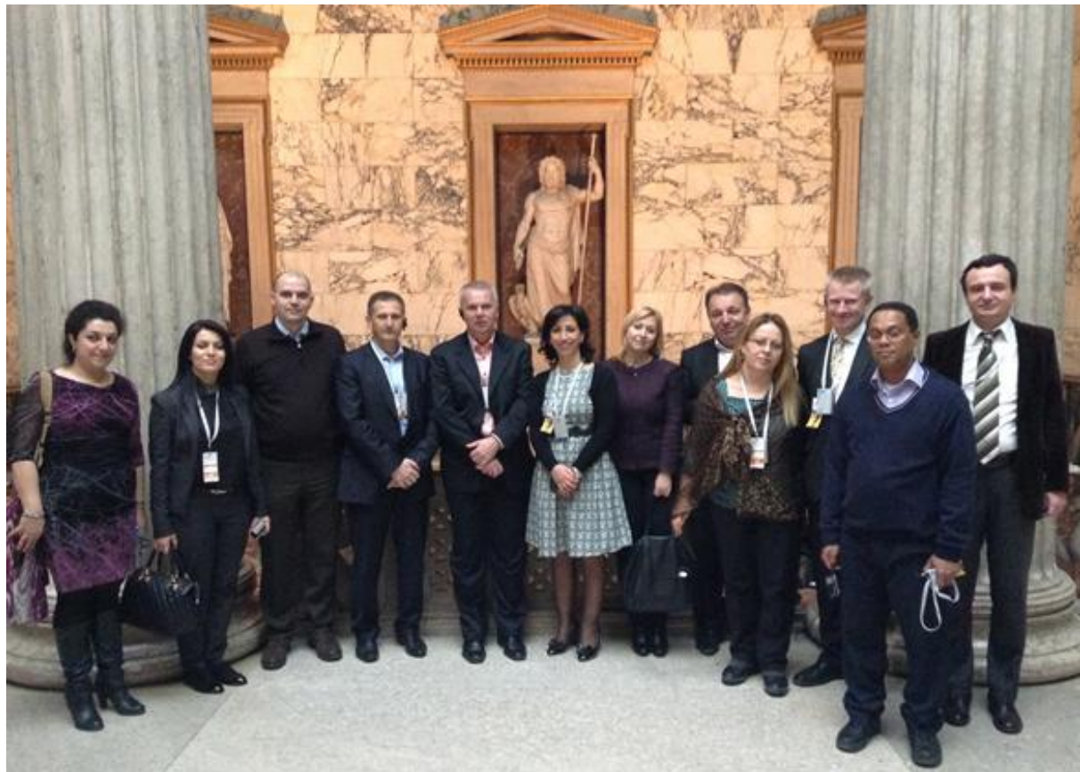
Participants of The Policy Seminar for Parliamentarians on Emerging Europe for Members of Parliaments from the Central and Southeastern Europe pose for a group photo.

MPs who were invited to the seminar to share their insight and experiences, and to identify areas where their work in parliament can contribute to advancing sound economic policies.