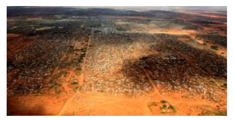
Aerial view of Dagahaley camp in Daadab, Kenya, April 2011

According to the UNHCR, there are currently 554,757 refugees in Kenya and 345,491 in Dadaab, who are mostly from Somalia.