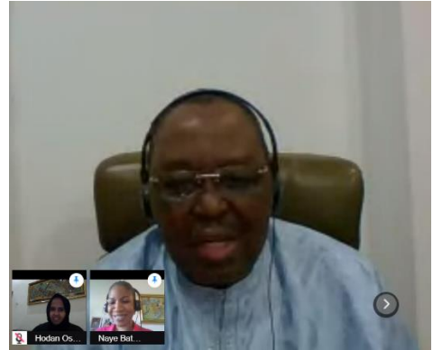
Haroun Kabadi MP, Tchad

Haroun Kabadi MP, Speaker Tchad National Assembly , stressed the need for increased international solidarity. He exhorted parliamentarians to keep playing their oversight role over development funds. Mr. Kabadi highlighted the importance of local actors, financing parliaments and taking a bottom-up approach on development issues to cope with FCV situations.