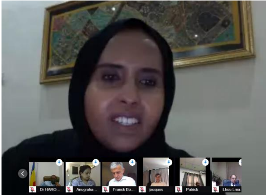
Senator Osman, Somalia

On The World Bank & International Monetary Fund