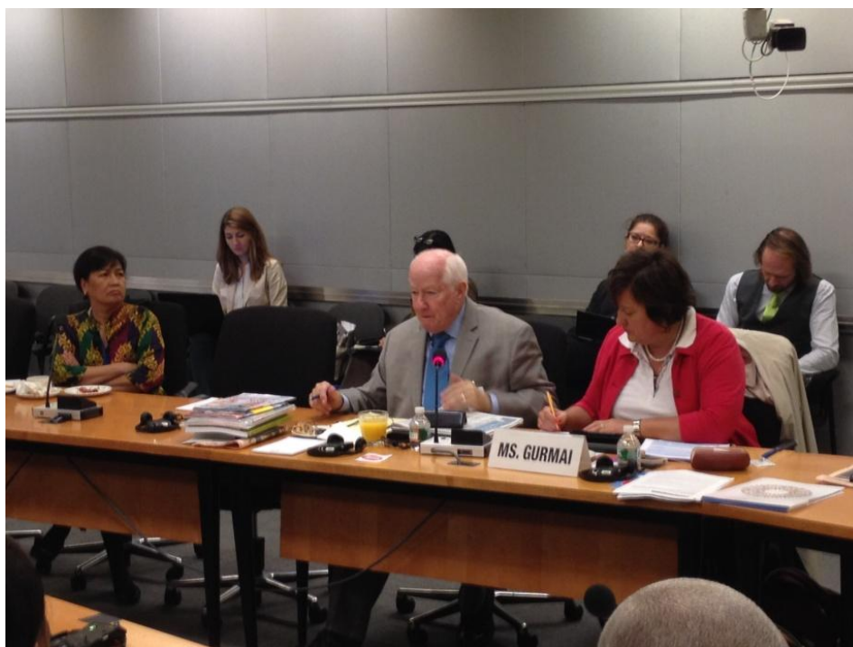
Jim Kolbe discusses the role of US Congress in international development.

Mr. Kolbe advised the Network parliamentarians to work more closely with US Congressional Staff who possess the institutional knowledge to aid furthering PN's commitment to inclusiveness, diversity, and equal opportunities.