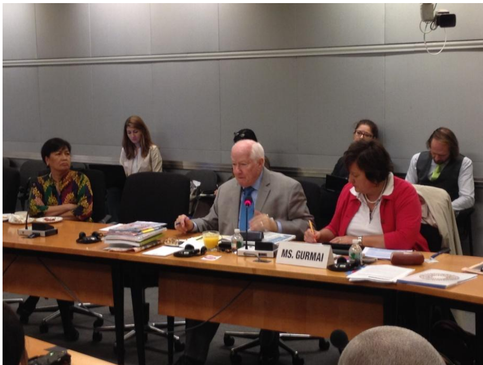
Jim Kolbe discusses the role of US Congress in international development.

Mr. Kolbe advised the Network parliamentarians to work more closely with US Congressional Staff who possess the institutional knowledge to aid furthering PN's commitment to inclusiveness, diversity, and equal opportunities.