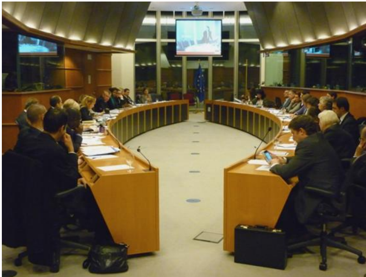
PN members, WB & IMF officials, and MEPs discuss the future of WB & IMF programs.

World Bank through strategy, policy and program-oriented actions.” During Ms. Barkbu’s presentation, the need for a two-way dialogue was also stressed as well as ways to tackle the problems weighing down the European economy today, since “both supply and demand policies are necessary.”