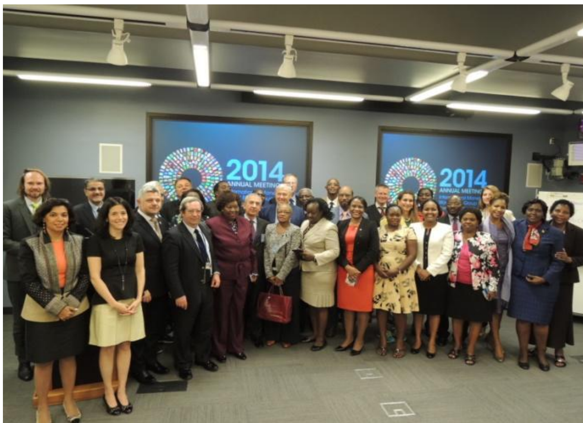
PN and Women In Parliament (WIP) members pose for a group photo after two days of discussion.

In a time of great global economic uncertainty, Members of Parliament (MPs) from across the globe convened for a workshop with high-level staff from the World Bank & International Monetary Fund (IMF) during 8-10 October in Washington, D.C. The workshop was held in the midst of the Annual Meetings for the two development organizations, as the PN sought to continue fostering dialogue between local actors and development partners in the knowledge-sharing process. The event was hosted by The Parliamentary Network on the World Bank & IMF (PN) and Women In Parliaments (WIP), which for the first time, partnered with the Network. Half the participants were women, highlighting the importance of inclusive, gender-equal leadership and development today. MPs learned how the World Bank & IMF serve as a resource of expertise and investment, while also having the forum to discuss ways in which a more comprehensive relationship would yield inclusive, good governance practice.