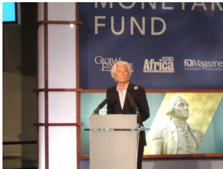
Managing Director of IMF Christine Lagarde addresses inclusive development in her speech.

Madame Christine Lagarde (Managing Director, IMF) made opening remarks of this session, stressing the subpar, mediocre nature of growth around the world. She noted how international growth has become uneven and brittle, citing concerns of global (200 million people, 30 million since the Great Recession), youth (13% worldwide, equating to 75 million young people), and women's (46% cannot find a in the Middle East job) unemployment. A Panel of the world's renowned economists discussed how to achieve robust and sustained growth. Issues such as urbanisation were brought to the forefront, as Paul Romer noted, "Cities are worth more to than they cost to build." Further, the lack of leadership was stressed by former President Ernesto Zedillo, carrying Madame Lagarde's comments into his own; "our growth perspectives are mediocre because policies are the same." The discussion section had plenty of questions from MPs, asking how they can bring about change and shared prosperity to their respective countries.