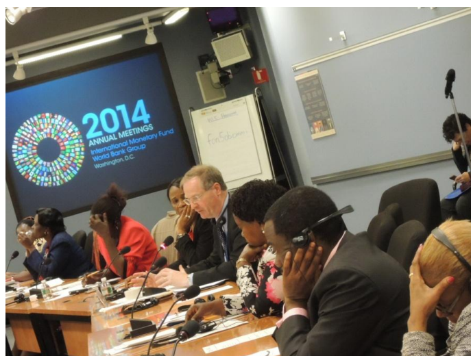
PN Chairman Jeremy Lefroy (MP, UK) leads a discussion session.