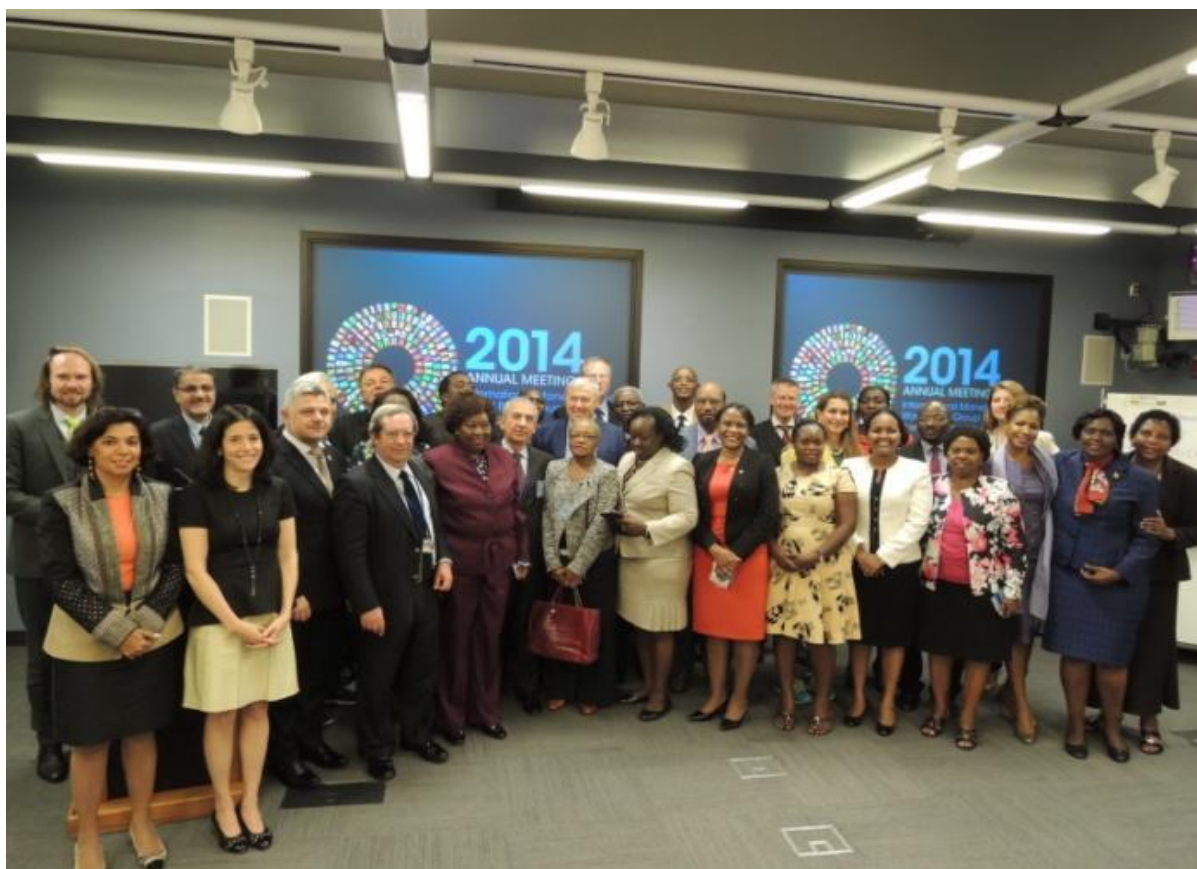
PN and Women In Parliament (WIP) members pose for a group photo after two days of discussion.

In a time of great global economic uncertainty, Members of Parliament (MPs) from across the globe convened for a workshop with high-level staff from the World Bank & International Monetary Fund (IMF) during 8-10 October in Washington, D.C. The workshop was held in the midst of the Annual Meetings for the two development organizations, as the PN sought to continue fostering dialogue between local actors and development partners in the knowledge-sharing process. The event was hosted by The Parliamentary Network on the World Bank & IMF (PN) and Women In Parliaments (WIP), which for the first time, partnered with the Network. Half the participants were women, highlighting the importance of inclusive, gender-equal leadership and development today. MPs learned how the World Bank & IMF serve as a resource of expertise and investment, while also having the forum to discuss ways in which a more comprehensive relationship would yield inclusive, good governance practice.