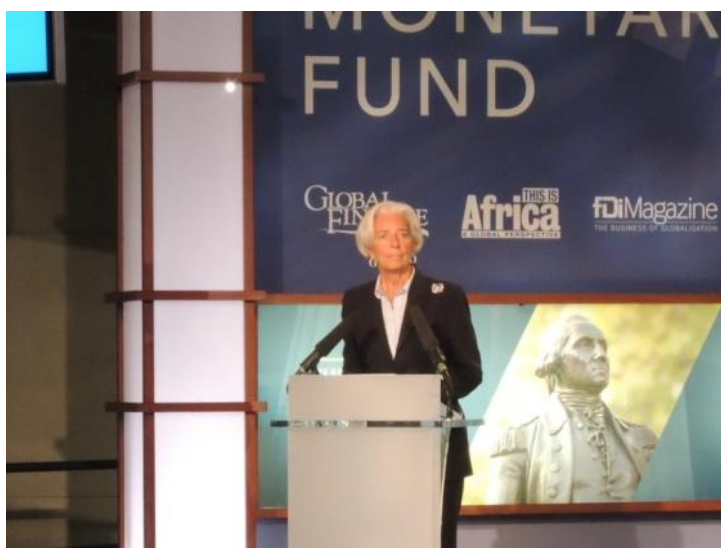
Managing Director of IMF Christine Lagarde addresses inclusive development in her speech.

Madame Christine Lagarde (Managing Director, IMF) made opening remarks of this session, stressing the subpar, mediocre nature of growth around the world. She noted how international growth has become uneven and brittle, citing concerns of global (200 million people, 30 million since the Great Recession), youth (13% worldwide, equating to 75 million young people), and women's (46% cannot find a in the Middle East job) unemployment. A Panel of the world's renowned economists discussed how to achieve robust and sustained growth. Issues such as urbanisation were brought to the forefront, as Paul Romer noted, "Cities are worth more to than they cost to build." Further, the lack of leadership was stressed by former President Ernesto Zedillo, carrying Madame Lagarde's comments into his own; "our growth perspectives are mediocre because policies are the same." The discussion section had plenty of questions from MPs, asking how they can bring about change and shared prosperity to their respective countries.