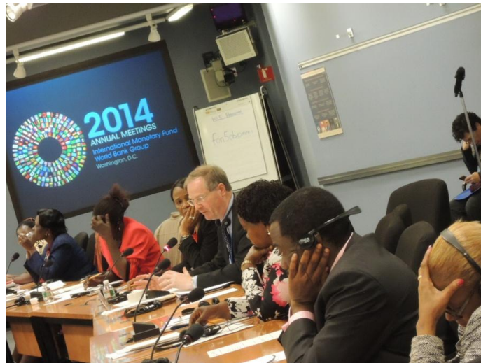
PN Chairman Jeremy Lefroy (MP, UK) leads a discussion session.

The direct and indirect effects of the epidemic are disrupting economic activity of the regions affected and discouraging investment where medical infrastructure is greatly needed. MP Helen Kuyembeh of Sierra Leone urged the international community to act immediately and noted the dire consequences if it failed to do so. The remainder of the discussion centered on the World Bank’s plan to provide the medical infrastructure to help fight ebola in the affected regions.