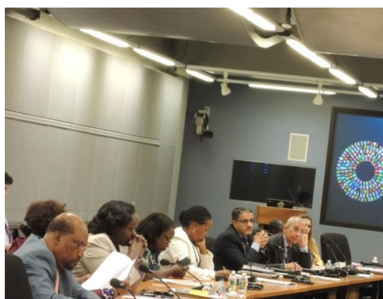
PN members and WBG & IMF officials engage in lively discussions.