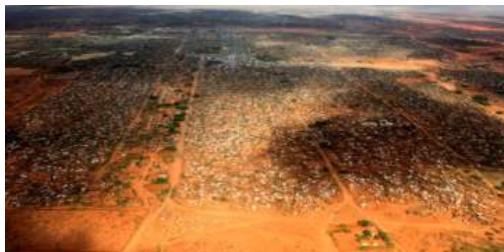
Aerial view of Dagahaley camp in Daadab, Kenya, April 2011

According to the UNHCR, there are currently 554,757 refugees in Kenya and 345,491 in Dadaab, who are mostly from Somalia.